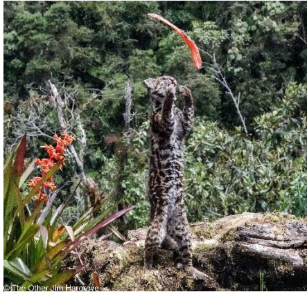
Oncilla leaps for her reward

Oncillas are smaller than typical house cats. This one was wild, not a pet, but had learned that showing off for tourists was rewarding. The hand of our hostess is just out of the image.