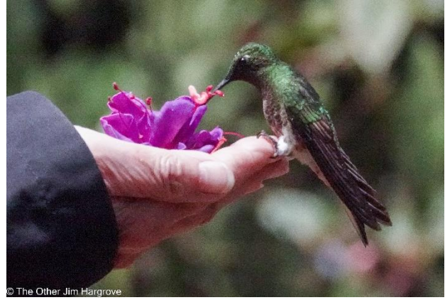
Linda Feeding Tourmaline Sunangel

We also saw many great birds, including this Tourmaline Sunangel hummingbird that was not afraid to eat from the flower Linda held.