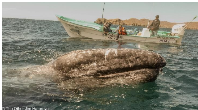
Gray Whale surfacing between our boat and another

Usually, our friends first question for us is, “Where are you going to travel next?” in 2024, the answer was “Baja California, Colombia, and Texas.”